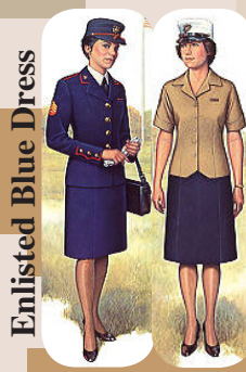
Enlisted Blue Dress