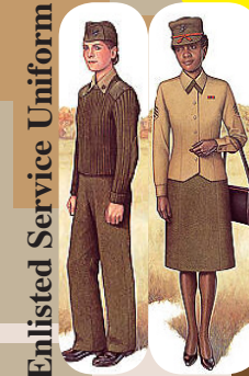
Enlisted Service Uniform