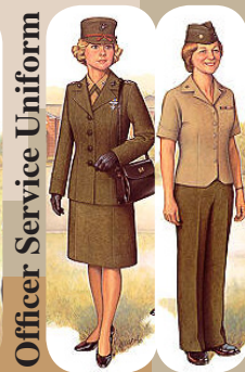
Officer Service Uniform