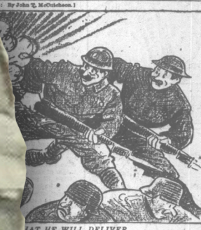
WHAT HE WILL DELIVER.

The Leviathan carried 10,000 soldiers on that particular trip and every precaution of camouflage and zigzag navigation was employed to protect it from the submarines since the German government is said to have offered a fortune and great honors to the commander and crew of the U-boat that succeeds in sinking it.