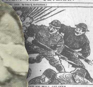
WHAT HE WILL DELIVER.