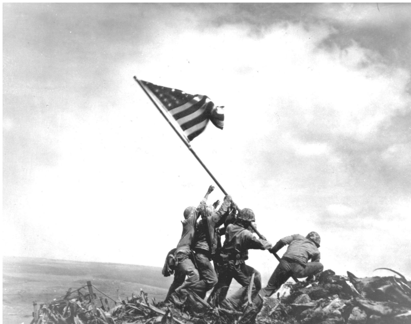
Attached Image: The famous flag raising photo taken by Joe Rosenthal on Mt. Suribachi, on February 23, 1945.

Dedicated to the preservation and promulgation of Marine Corps history, culture and traditions, and the education of all American of its virtues, the Marine Corps Heritage Foundation was established in 1979 as a non-profit 501(c)(3) organization. The Foundation supports the historical programs of the Marine Corps in ways not possible through government funds. The Foundation provides grants and scholarships for research and the renovation, restoration, and commissioning of historical Marine Corps artifacts and landmarks. Having secured the necessary funding for the complete construction of the National Museum of the Marine Corps and Heritage Center, located in Triangle, Virginia, the Foundation's current primary mission is to vigorously seek financial support to expand programs at the National Museum of the Marine Corps and beyond its walls. For more information, visit marineheritage.org .